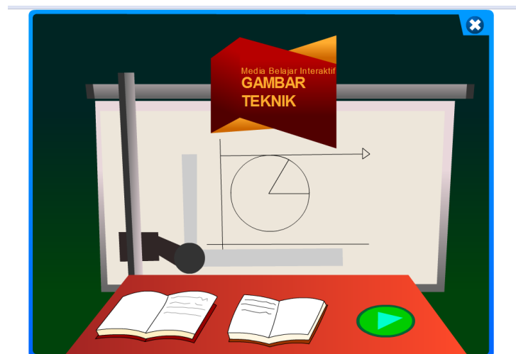
Figure 2. E- MMAED preview.

At the beginning of the opening E-MMAED will appear as shown in Figure 2, which consists of: Syllabus and RPP, Instructions for Use, Play button.